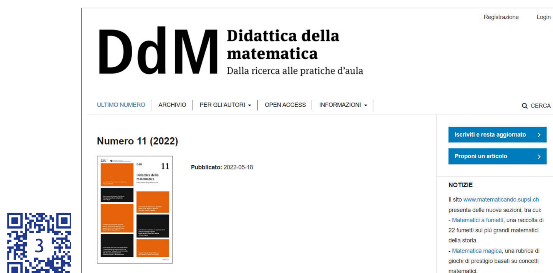
Figure 3. The www.rivistaddm.ch website hosts the DdM journal issues.

Research and dissemination projects carried out by the Competence Centre for Mathematics Teaching (DDM) of the SUPSI's Department of Education and Learning (DFA) are aimed at designing, testing and disseminating innovative didactic approaches for teaching-learning mathematics.