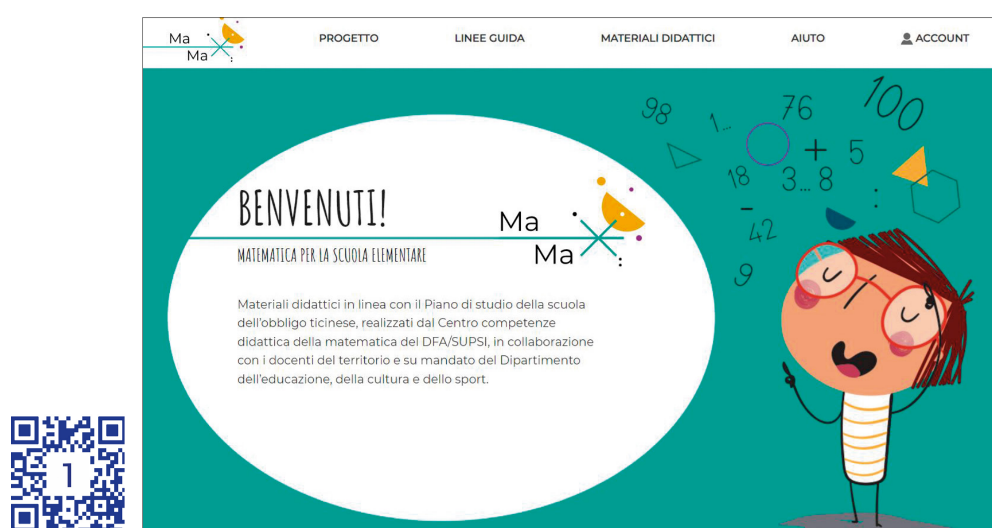
Figure 1. The mama.edu.ti.ch website collects materials for teachers and students.